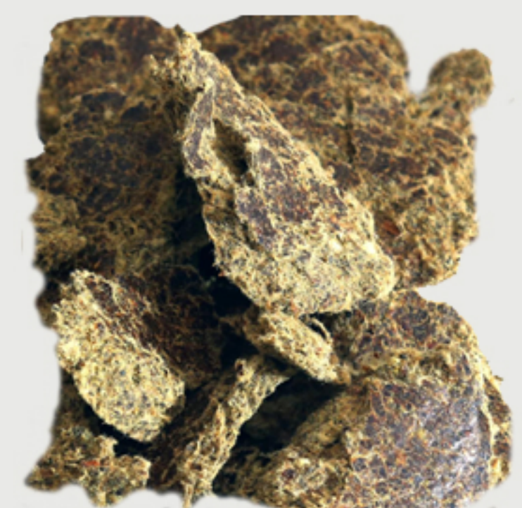
Cotton Seed Cake