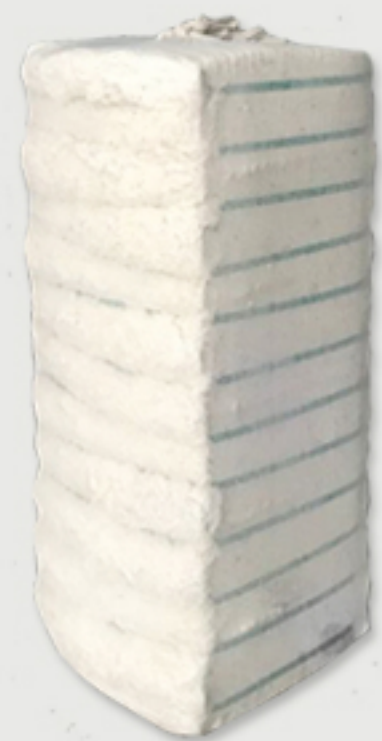
Process Cotton Bales