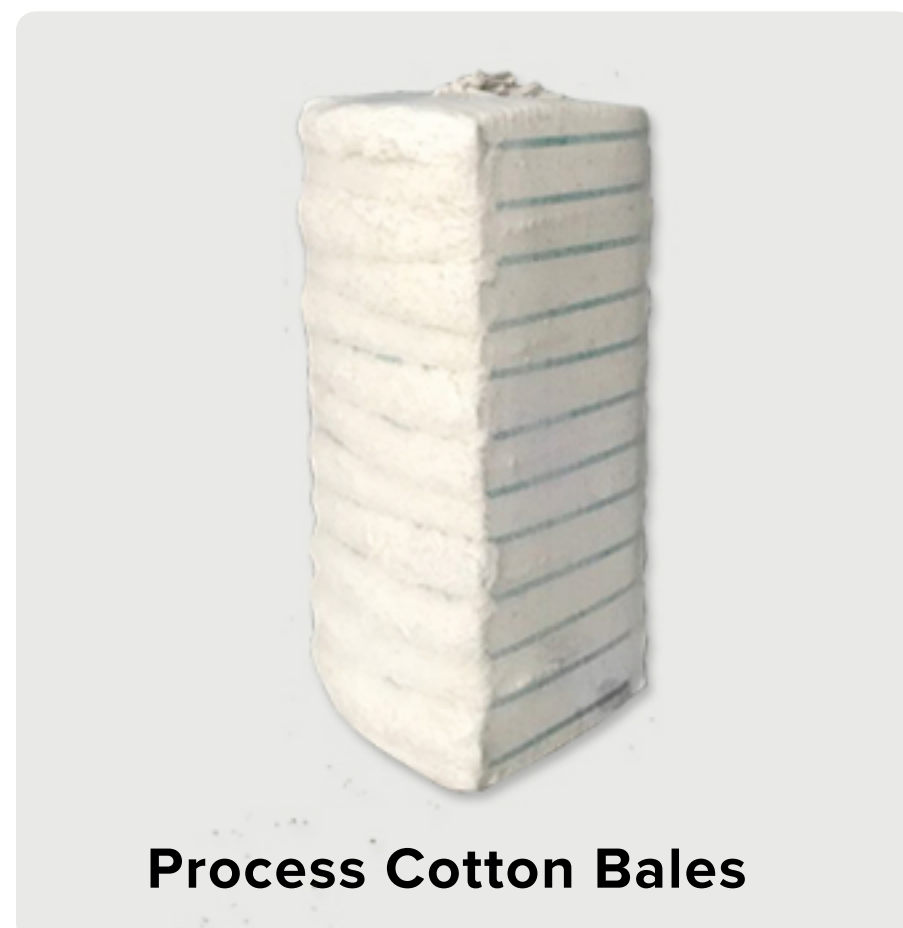
Process Cotton Bales