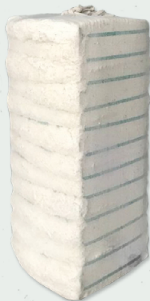
Process Cotton Bales