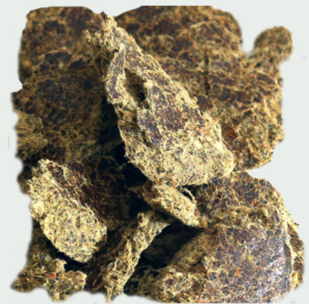
Cotton Seed Cake